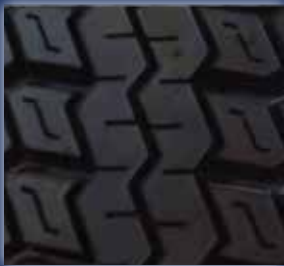
Radial HD 827