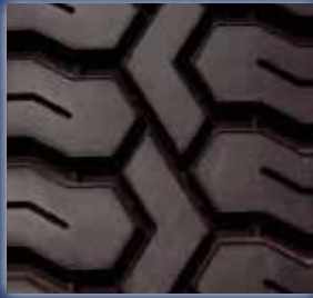
Semi Lug HDT