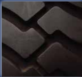
MS Lug Design