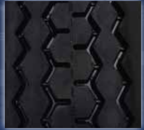
Marathon Dag Design